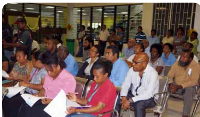
► Participants and invited guests during the launching of the MRI Scanner at Port Moresby General Hospital.