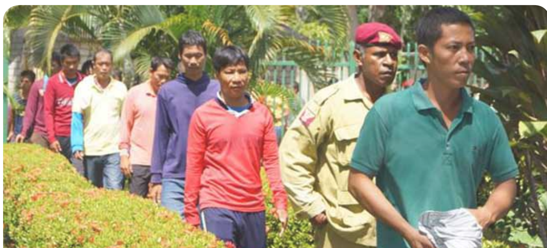
▶ PNG Correctional Services Institute Staff escorted Illegal Fishermen to the Bomana Court House outside Port Moresby on Friday 3rd March 2017 before the District court sentenced them for four years at Bomana Prison with hard labour.