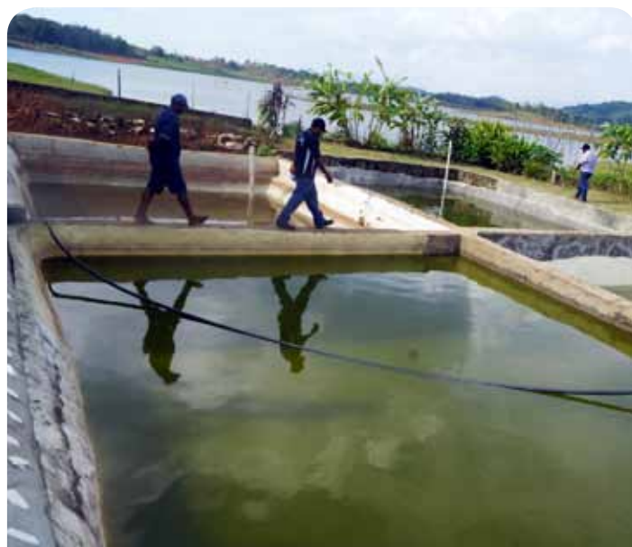
► Officials from NFA and invited guests from various agencies toured the Tilapia Hatchery and Tilapia Cage Project.