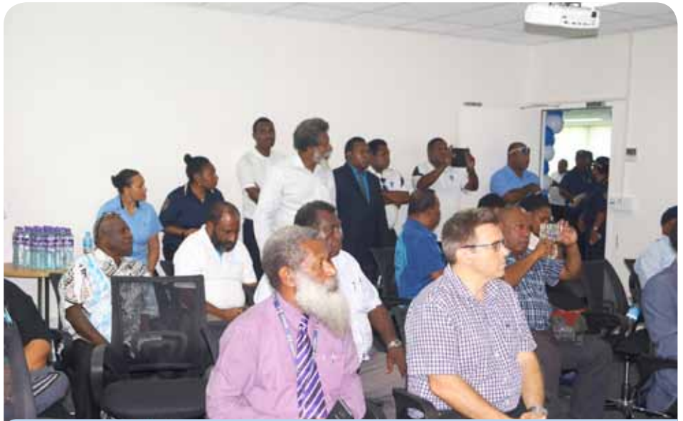
► Guests and agency representatives at the launch of the NFA Command Centre.

NFA has worked around to find a way to increasing the efficiency of available MCS resources and tools to remotely tracking the movements of fishing vessels.