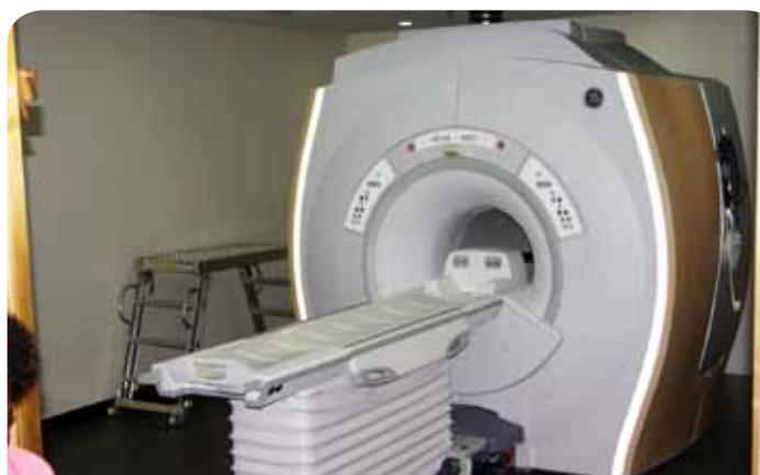
► The Magnetic Resonance Imaging (MRI) Scanner.