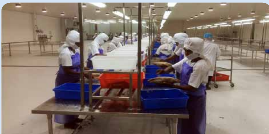
► Local employees of Nambawan Seafoods at the Cannery.

is a joint venture company among Trans-Pacific Journey Fishing Corp (TPJ), TSP Marine Industries and FCF Fishery Corporation .