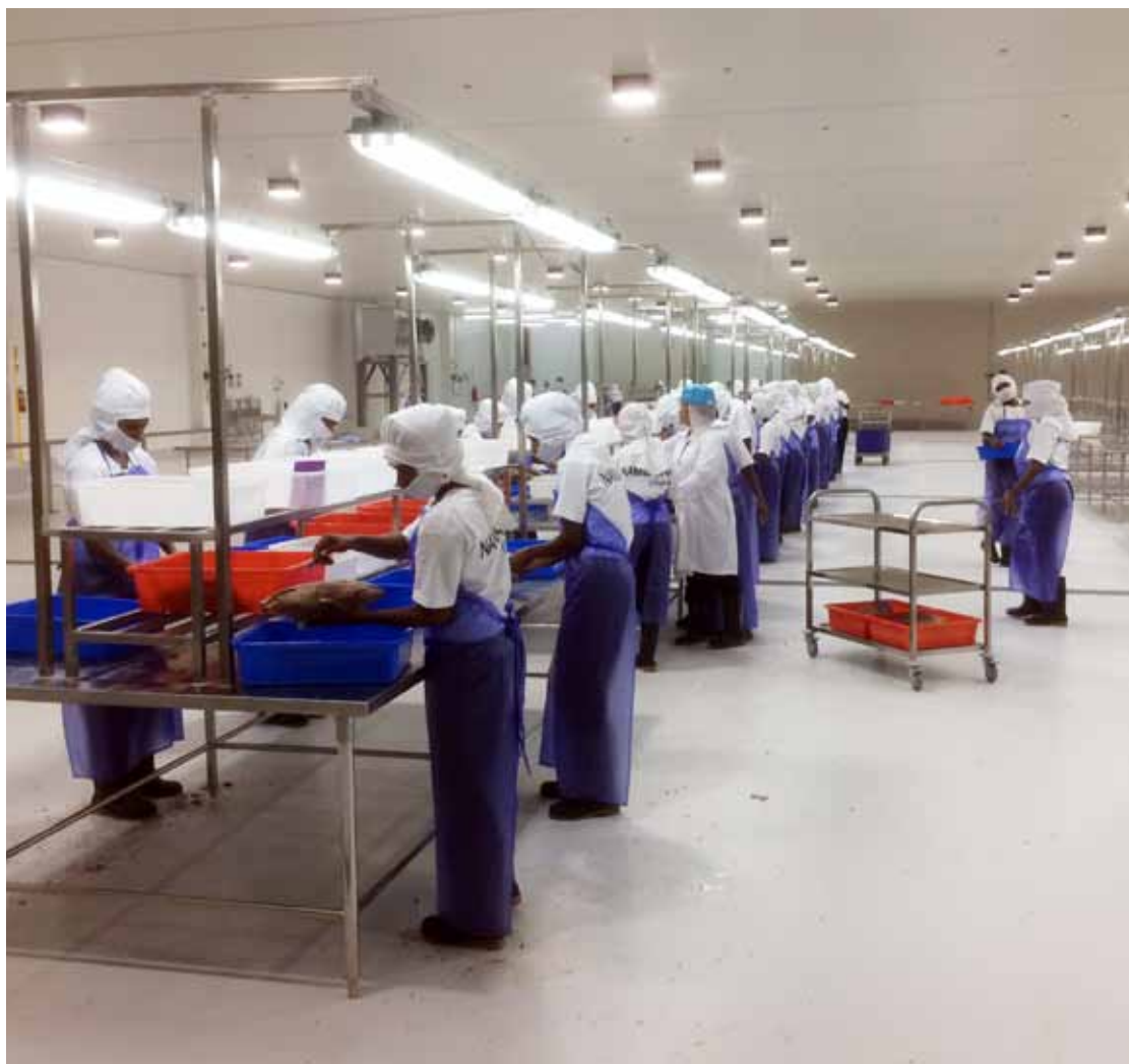
▶ ABOVE: Employees of the Nambawan Tuna Cannery at work.