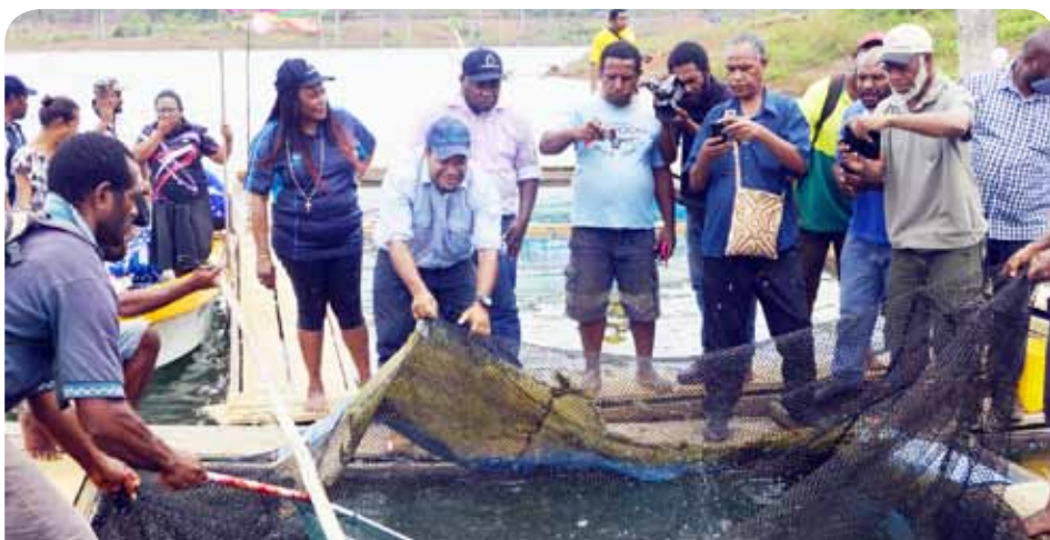
► NFA officially launched the Sirinumu Tilapia Hatchery and Tilapia Cage Project at Sirinumu Dam, Sogeri in the Central Province.