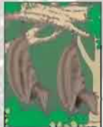
OL MANGORO DIWAI I NIDIM OL BILAK-BOKIS NA OL BINATANG LONG MARITIM OL FLAWA BLONG OL.