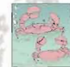
OL LIP IDAI NA OL I PUDAUN IGO LONG WARANA I KAMAP OLSEM KAIKAI BILONG OL KUKA, KINDAM NA SELPIS.