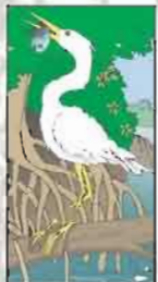
OL MANGORO I NABAWAN HAP BILONG OL KANAI NA OL ARAPELA PISIN LONG PAINIM KAIKAI.